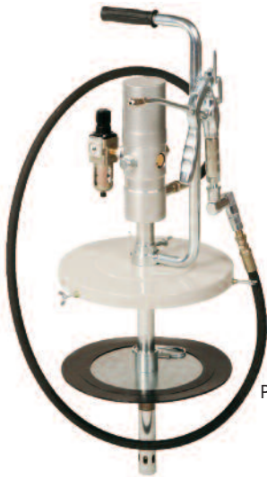
P/N 13027T-S3 shown

Same as 13027T-S3 except with flex spout control valve P/N 12070TZ.