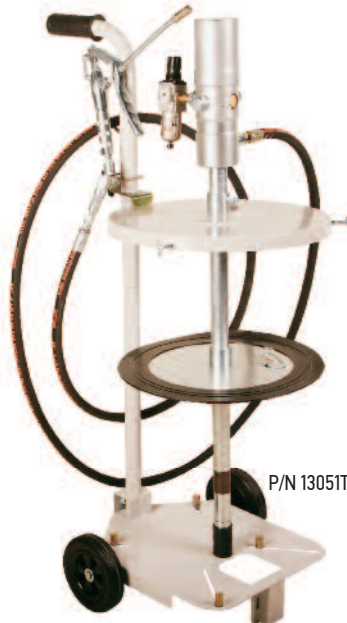
P/N 13051T-S4 shown

Same as 13051T-S4 except with flex spout control valve P/N 12070TZ.