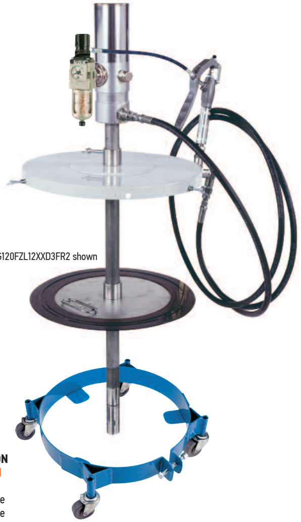
P/N G120FZL12XXD3FR2 shown

Example of customized grease system for 120 lb. drums includes a flex control handle with 'Z' swivel, a 3/8" x 12' hose, no air hose, a 120 lb. drum dolly and air filter/regulator w/gauge (150 PSI input capability).