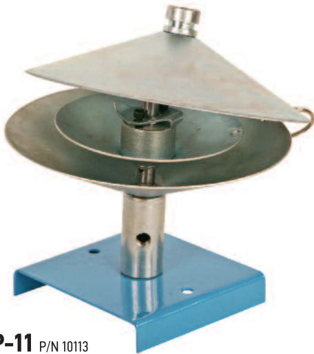
MODEL BP-11 P/N 10113

Same as MA-11 above except pump, cover and follower are sized to fit 120 lb. drums.