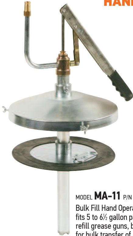
MODEL MA-11 P/N 10011

Bulk Fill Hand Operated Grease Pump Kit, fits 5 to 6½ gallon pails. Pump is used to refill grease guns, bearing packers and for bulk transfer of grease. Pump is not