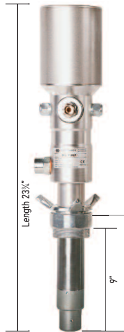
P/N 21400-S2 8:1, 5.5 GPM