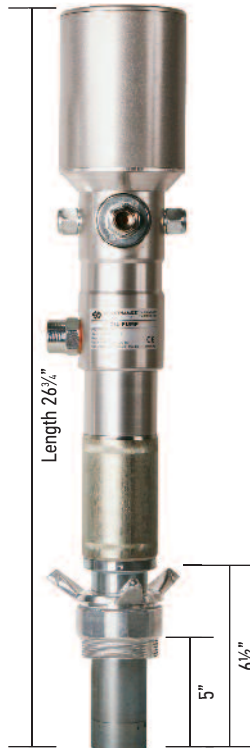
P/N 21300-S1 5:1, 12 GPM