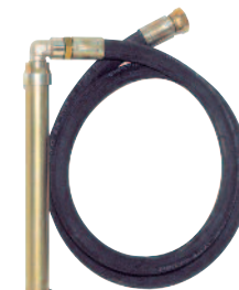
P/N 950065 shown