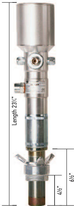
P/N 21200-S1 5:1, 8 GPM