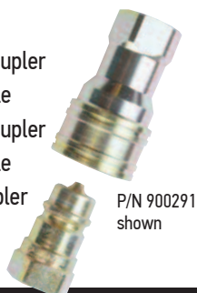
P/N 900291 shown