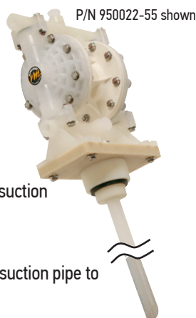
P/N 950022-55 shown

Convenient kit for use with 55 gallon drums, has 2" male NPT threads to fit drum and tank bungs. Includes 1/2" double diaphragm pump, mounting bracket, hardware, 35" long suction tube and 1/4" air filter/regulator. A 3/8" return port is included in the bung to allow use with a thermal relief valve if desired.