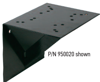
P/N 950020 shown

Wall Mounting Bracket for 1/2", 3/4" and 1" Double Diaphragm Pumps. 10" H x 12" W x 10" D.