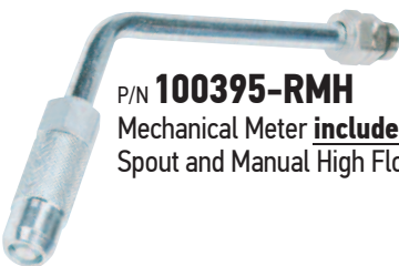
P/N 100395-RMH Mechanical Meter includes Control Handle, Rigid Spout and Manual High Flow Tip