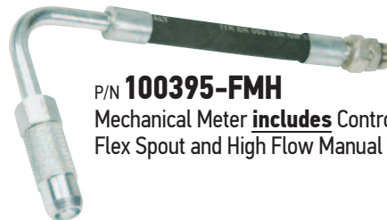
P/N 100395-FMH Mechanical Meter includes Control Handle, Flex Spout and High Flow Manual Tip