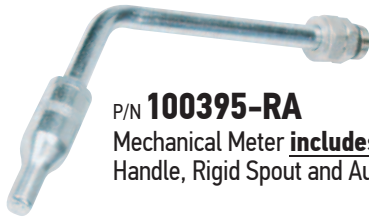
P/N 100395-RA Mechanical Meter includes Control Handle, Rigid Spout and Auto Tip

Order meter/control handle with your choice of spout and tip, for example – if you wish to order the meter and control handle with a flex spout and manual tip as shown below – then order P/N 100395-FM .