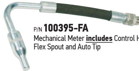
P/N 100395-FA Mechanical Meter includes Control Handle, Flex Spout and Auto Tip