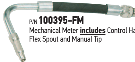
P/N 100395-FM Mechanical Meter includes Control Handle, Flex Spout and Manual Tip