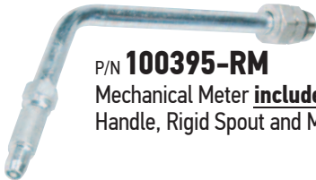
P/N 100395-RM Mechanical Meter includes Control Handle, Rigid Spout and Manual Tip