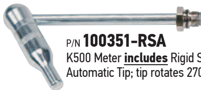
P/N 100351-RSA K500 Meter includes Rigid Spout and Automatic Tip; tip rotates 270°

Order meter/control handle with your choice of spout and tip, for example – if you wish to order the meter and control handle with a flex spout and manual tip as shown below – then order P/N 100351-FM .