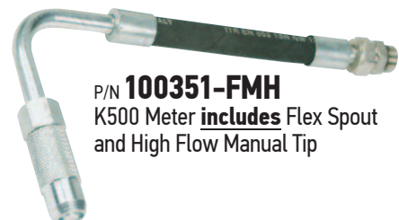
P/N 100351-FMH K500 Meter includes Flex Spout and High Flow Manual Tip