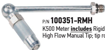
P/N 100351-RMH K500 Meter includes Rigid Spout and High Flow Manual Tip; tip rotates 270°