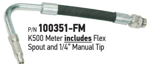
P/N 100351-FM K500 Meter includes Flex Spout and 1/4" Manual Tip