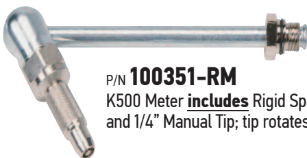
P/N 100351-RM K500 Meter includes Rigid Spout and 1/4" Manual Tip; tip rotates 270°