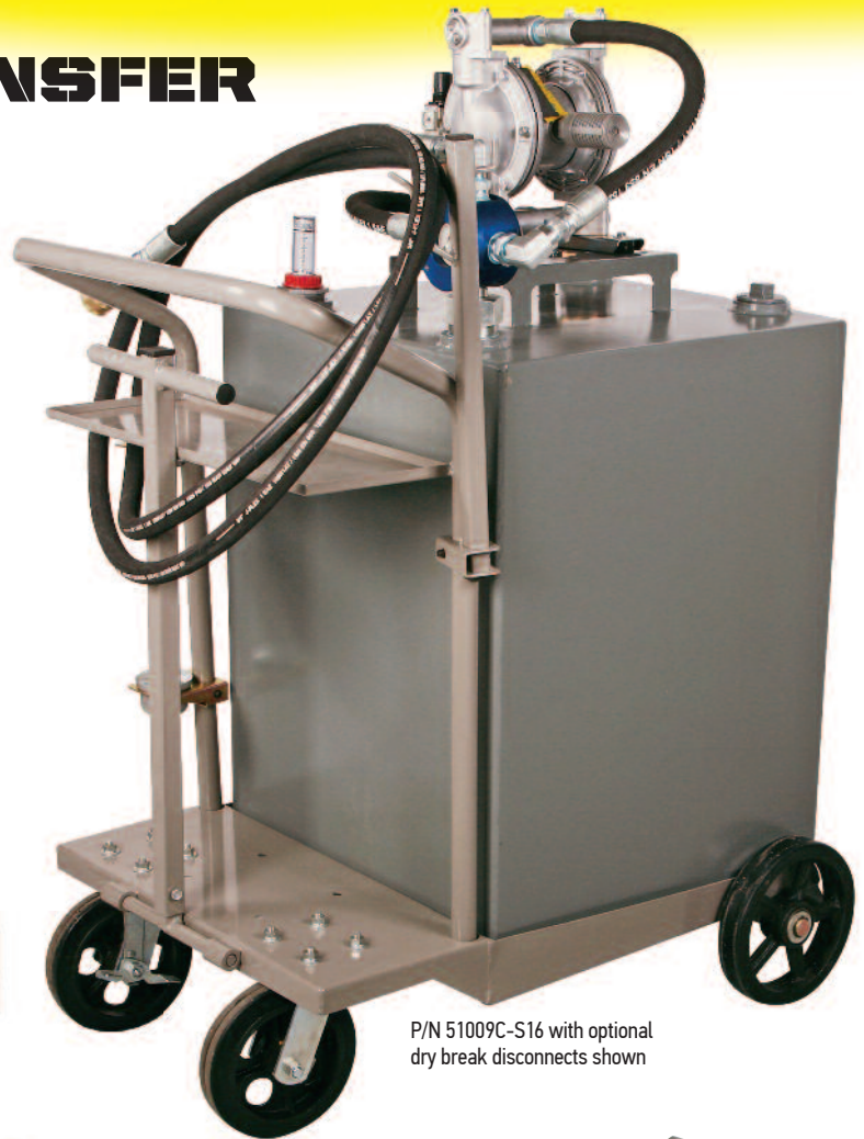
P/N 51009C-S16 with optional dry break disconnects shown

95 Gallon Cart for Two Way Oil Transfer.