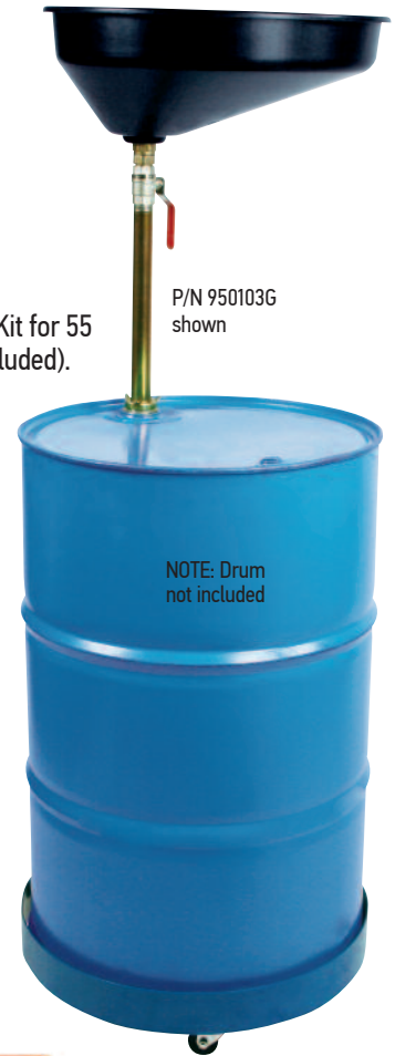
P/N 950103G shown