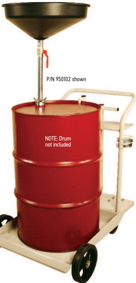
P/N 950102 shown