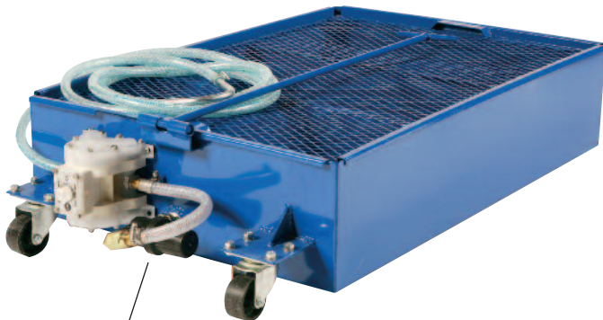
"T" Strainer with 30 Mesh Screen

Same as P/N 42070 above except has an on board 3/8" Double Diaphragm Pump and 6' discharge hose with curved spout. Flow rate of 5 GPM @ 100 PSI will empty full drain in less than 5 minutes. Includes 'T' strainer to protect pump.