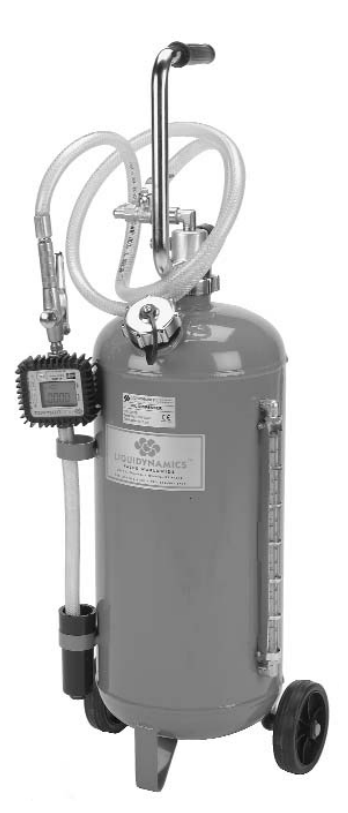
Model 24128MQ 6 gallon Oil Dispenser with Meter