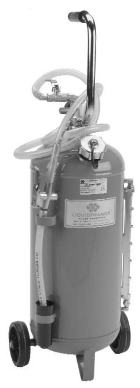
Model 24128 6 gallon Oil Dispenser